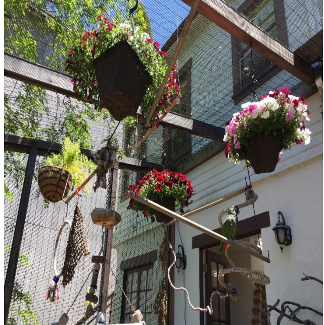
Bialy (middle right) enjoying time in the aviary.