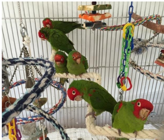
Beale. Montv. Clem. Bix. Jules. and Moosh

CR: I can say that the biggest change to our lives happened when we saw the movie "The Wild Parrots of Telegraph Hill" and discovered that Mickaboo was the point-person for rescuing the sick and injured flock members since 2003. We fell in love with that flock and took a hike up Telegraph Hill, lucky enough to see the flock in the trees on the Filbert steps. We had brunch at Julius' Castle by Coit Tower and watched the flock camouflaged amidst red berry trees. We wandered through North Beach stopping in bookshops and cafes before heading over to Ferry Plaza in hopes of catching the flock roosting. And we did. John said that was the happiest day of his life.