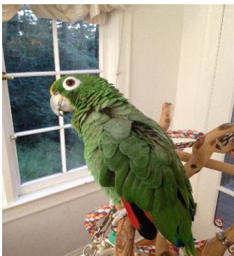
Jake, their stunning Amazon foster bird

I was a technical writer at the time and Mickaboo was just beginning to organize its internal and external documents on our internal wiki and public web sites. I jumped right into organizing content and writing documents on how to use our internal tools. It was a perfect fit for my skill set and my obsessive-compulsive nature.