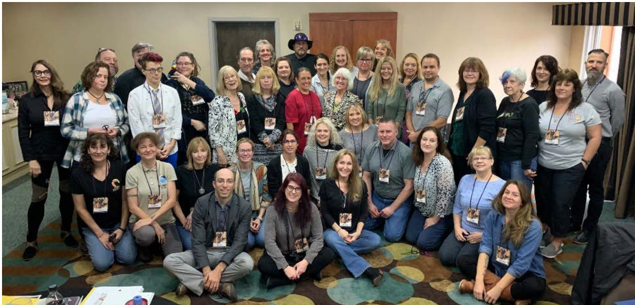
This photo was taken at the start of the conference, featuring all the attendees and speakers. The event included forty amazing individuals, all respected and established members of the avian rescue and sanctuary community across North America – and beyond.