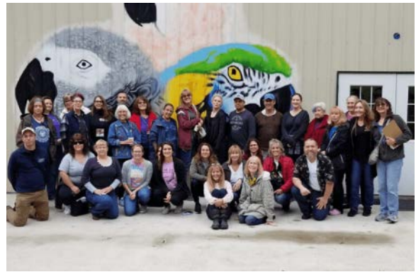
Following the conference, many attendees stayed to visit EAST's facility

Copyright © 2020 Mickaboo Companion Bird Rescue All Rights Reserved