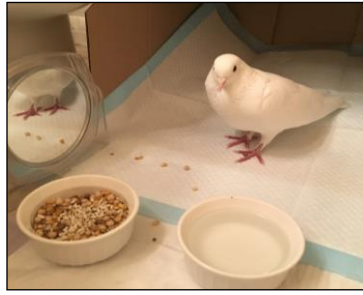
Her food and water – after.