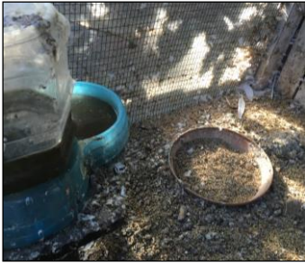
Her food and water – before.