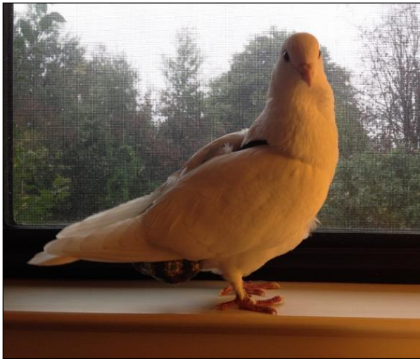
Wearing pants for the first time.