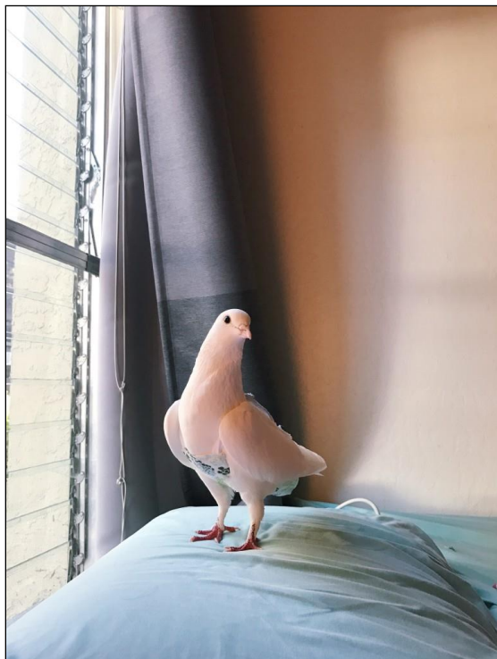
Miu is safe and happy now.