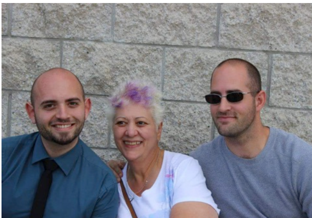
Proud mom with her two sons