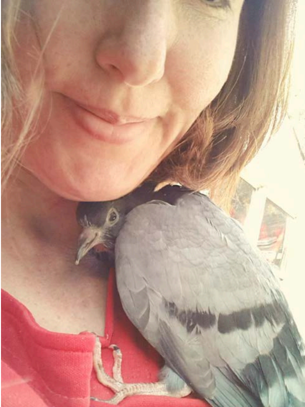
Palomacy volunteer Steph comforts the rescued youngster