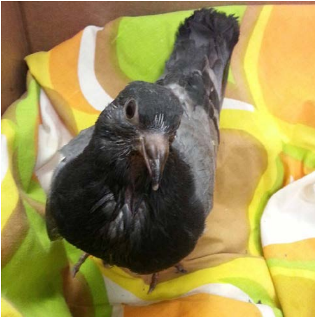
Finally- rescued and safe after a long hard week