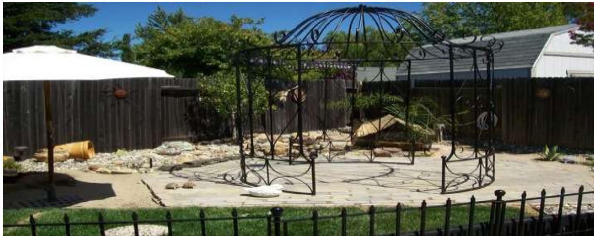
The Tortoise Enclosure