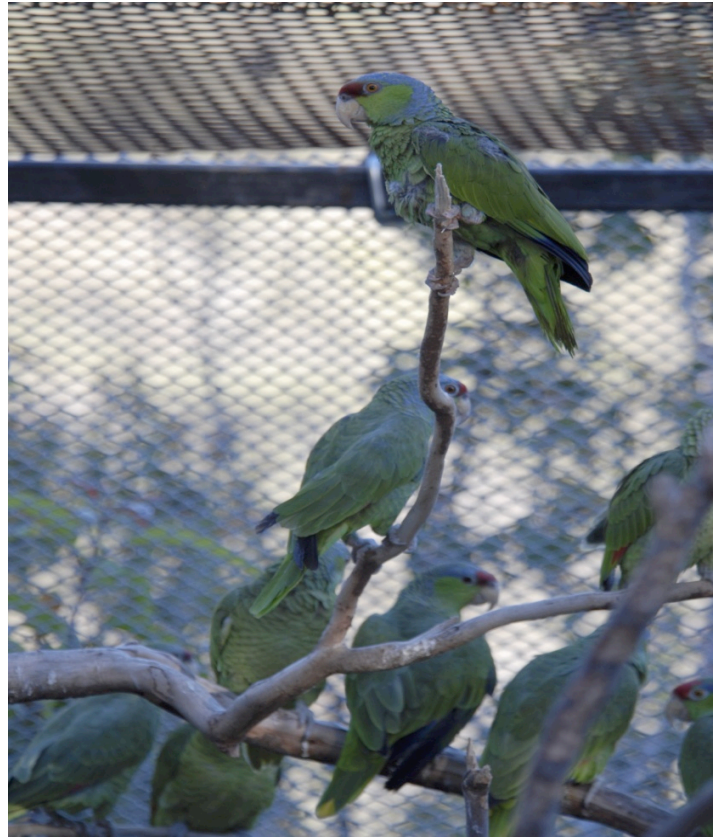
Figgy (at top) settling in at the SoCal Parrot aviary.