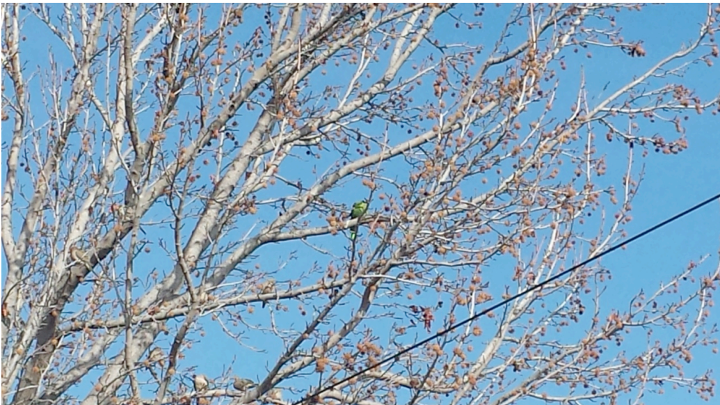
This photo was on January 1, 2014. Figgy is in the center of the tree. After the fireworks the prior evening and a stressful morning he stayed in this tree most of the day, something we had not seen him do before. He must have been exhausted.