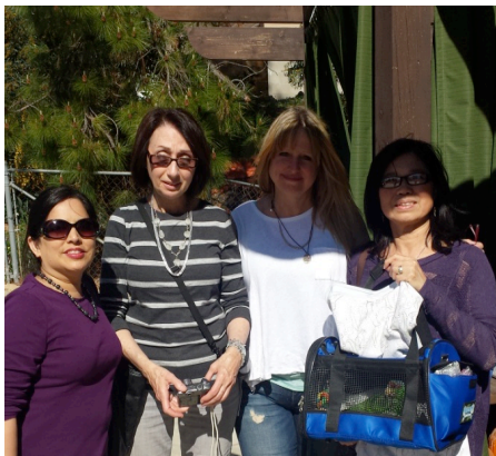
Team Figgy arrives with the newest addition to the flock!